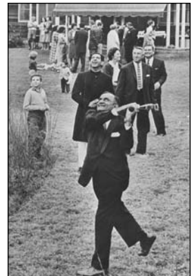
Playing Golf in Darion on the occasion of 'India Day'