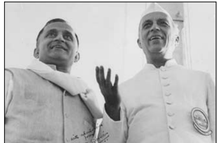
With Pandit Nehru at the Avadi Congress in 1955