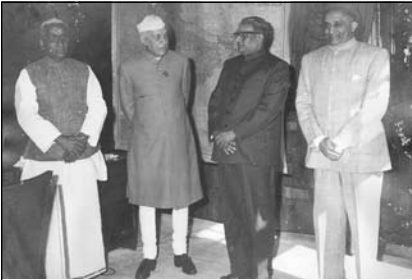
With M. Bakthavatsam, former Chief Minister of Madras, and Pandit Jawaharlal Nehru