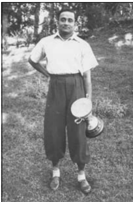
C.R.P. with Golf trophy