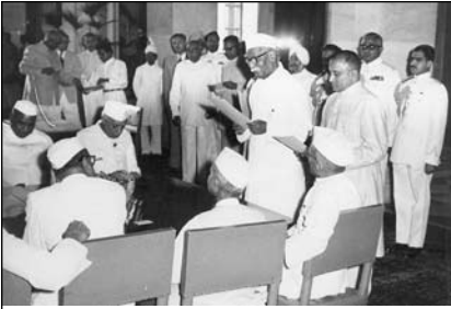
C.R.P. swearing in as Deputy Minister for Labour, Employment and Planning in the cabinet of Pandit Jawaharlal Nehru