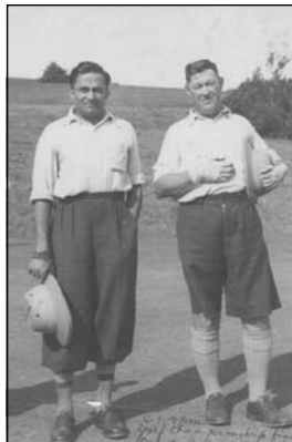
South India Open - Golf finals. First Indian in the Finals