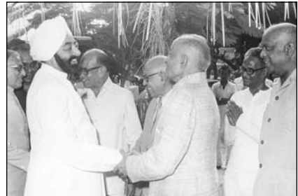
With Shri. Zail Singh, former President of India, on the occasion of the Foundation Stone Laying Function of Bhavan's Rajaji Vidyashram building in 1983