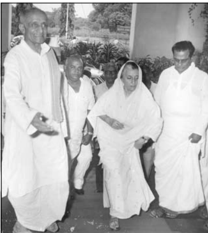
Receiving Smt. Indira Gandhi at Madras in 1980

terrible anti-Hindi riots in Madras State. In fact his constituents in Kumbakonam requested him to stand as an independent. However, he had inherited his father's strong sense of loyalty and, in spite of knowing that he would lose, refused to stand down or desert his party. Thereafter, he was appointed Chairman of Cochin Refineries Limited, a post he held till 1975, when he resigned.