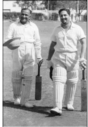
C.R.P. with former cricketer Gundappa Vishwanath