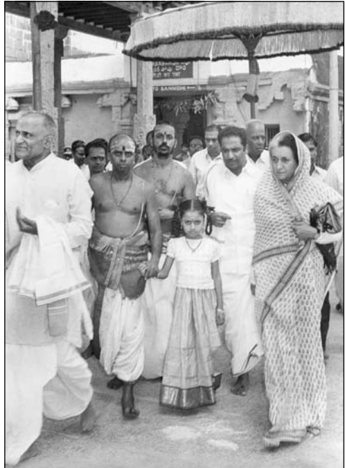
With Smt. Indira Gandhi at Kamakshi Amman Temple, Kanchipuram

He was deeply devoted to the philosophy of Advaita and a shishya of two great