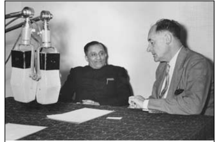
A.I.R. Interview in 1957