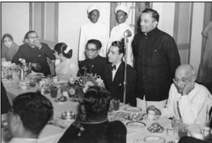
With Rajaji in 1953

In 1921 he was one of the student leaders who led the boycott against the visit of the Simon Commission to India. As a student in England, he participated in the India League activities between 1929 and 1932. After his return he became a busy lawyer till Mahatma Gandhi's visit to Madras in 1946, when he became the leader of the volunteers. His involvement with the Congress party and politics increased till he became a member of the Reception Committee of the Avadi Session of the Congress in 1955. In the same year, he accompanied the Indian delegation to the United Nations General Assembly as Legal Adviser.